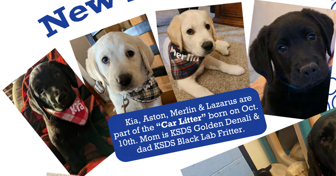
Kia, Aston, Merlin & Lazarus are part of the "Car Litter" born on Oct. 10th. Mom is KSDS Golden Denali & dad KSDS Black Lab Fritter.