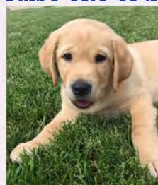
Tank as a puppy on the KSDS campus in 2016