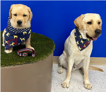
TJ (left) at turn out & Keller (right) at turn in January 2023.

She says Tank was just like his dad Mullins. “He is a solid lab. From his temperament to his diet and skills, he reminded me so much of his dad. He was such a joy to raise!” She added that his name became his agenda: “big, solid, steady, determined.”