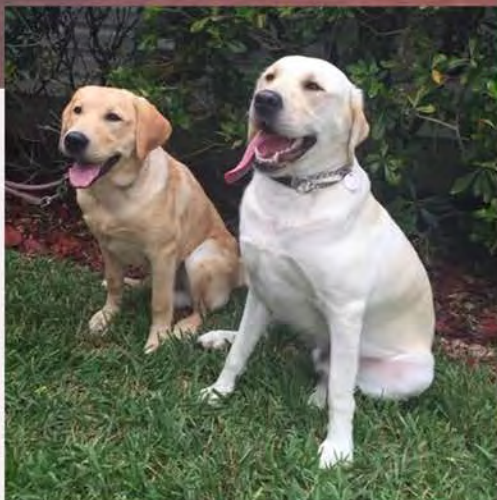
Pictured is KSDS Tank (left) and his dad Mullins (right)