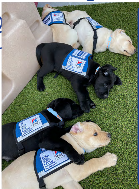
K-State Athletics Litter

KSDS Sprinkle gave birth to five girls & three boys on Dec. 12th. Names of the pups were sponsored by generous donors. As part of the breeding program, three pups are heading to other schools.